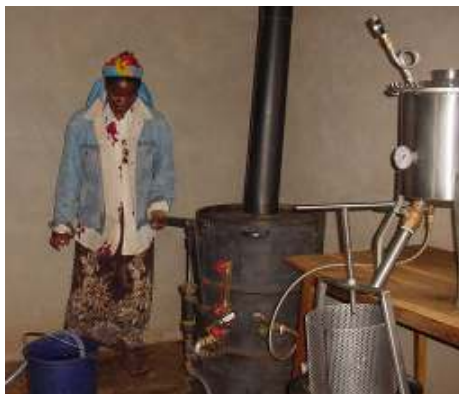
Filling the boiler from a bucket, Mozambique ←

Malnutrition Matters, as of 09/07, has installed over 30 VitaGoat systems in Africa, India and North Korea. The first three pilot installations, in Guinea, Mozambique and Chad were done in partnership with Africare in 2004/5. Since then, experience has shown that with minimal training, the VitaGoat can be operated at the expected production capacity in typical field environments (no electricity, limited water supply). The production of soymilk, fruit and vegetable purees, and ground nuts have proven very desirable from a consumer perspective and the VitaGoat can be viable as a business where it is used by a cooperative or as a micro-enterprise. In North Korea, in partnership with First Steps, more than 10 VitaGoats have been installed in social feeding programs in schools, orphanages and collective farms. The first three of 20 VitaGoats for a mid-day meal program operated by women's Self-Help Groups in Orissa (India) are being installed in October 2007. This World Bank supported project has 75% of the capital equipment cost financed by BISWA, the local NGO partner, and is sustainable without additional funding.