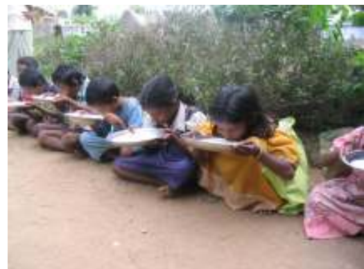
School children drinking soymilk from their lunch plates, Orissa →